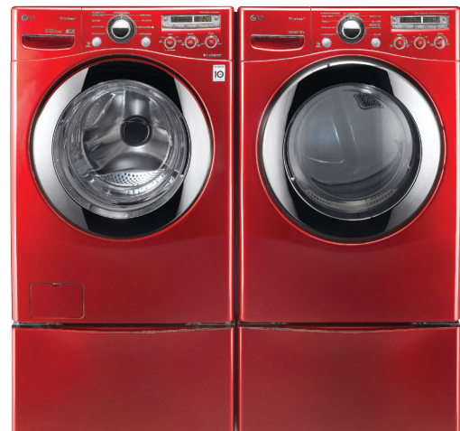
Wild Cherry Red